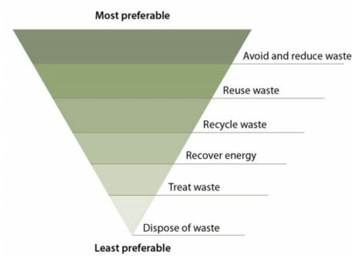
Figure 3-1 Waste Hierarchy